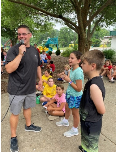
Leading Joke Day